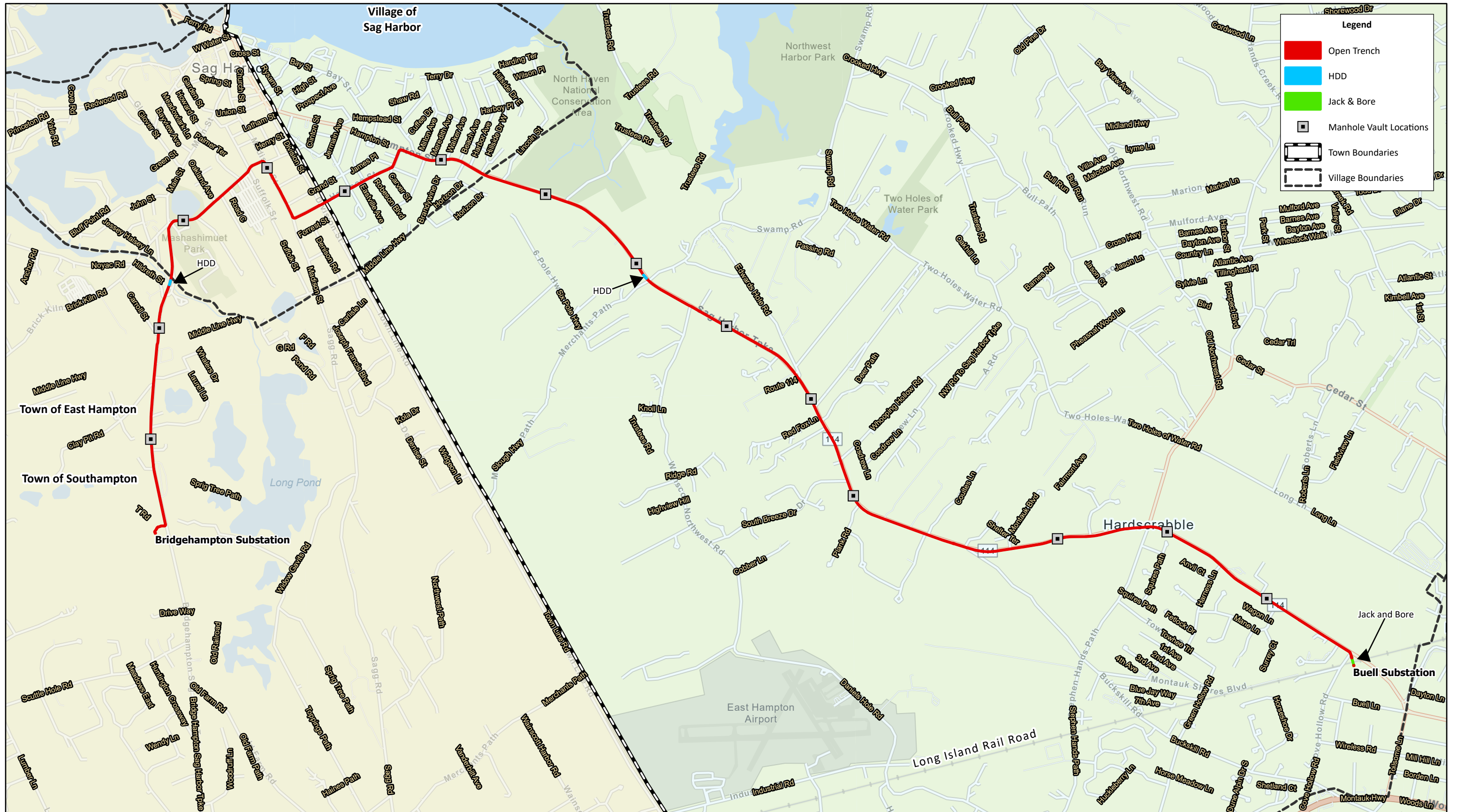
FIGURE 1 PREFERRED ALTERNATIVE ROUTE MAP BRIDGEHAMPTON TO BUELL NEW 69KV UNDERGROUND TRANSMISSION CABLE