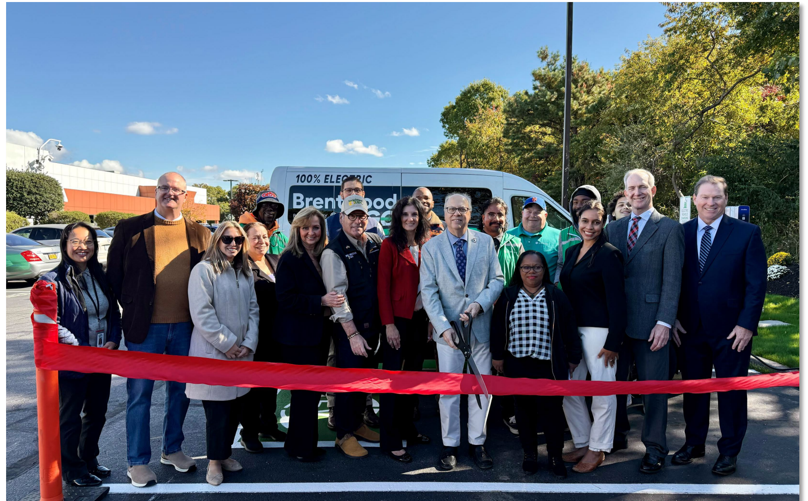
The ribbon cutting was held on October 15 in Hauppauge.